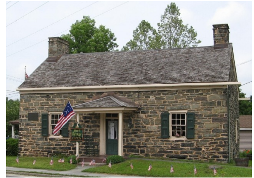
Fort Decker 127 West Main St. Port Jervis, NY 12771

Fort Decker needs re-pointing to stabilize the structure. To accomplish this Minisink Valley Historical Society is undertaking a year-long fundraiser. Three experts on historic masonry restoration have estimated a cost of $50,000 for full repair of the building.